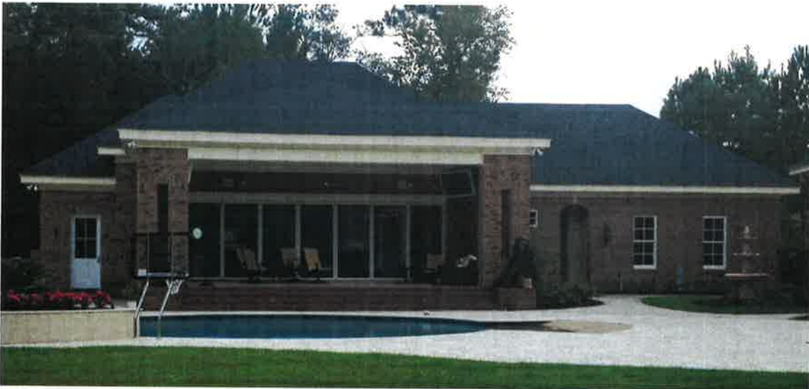
Front View - 8-24-2012