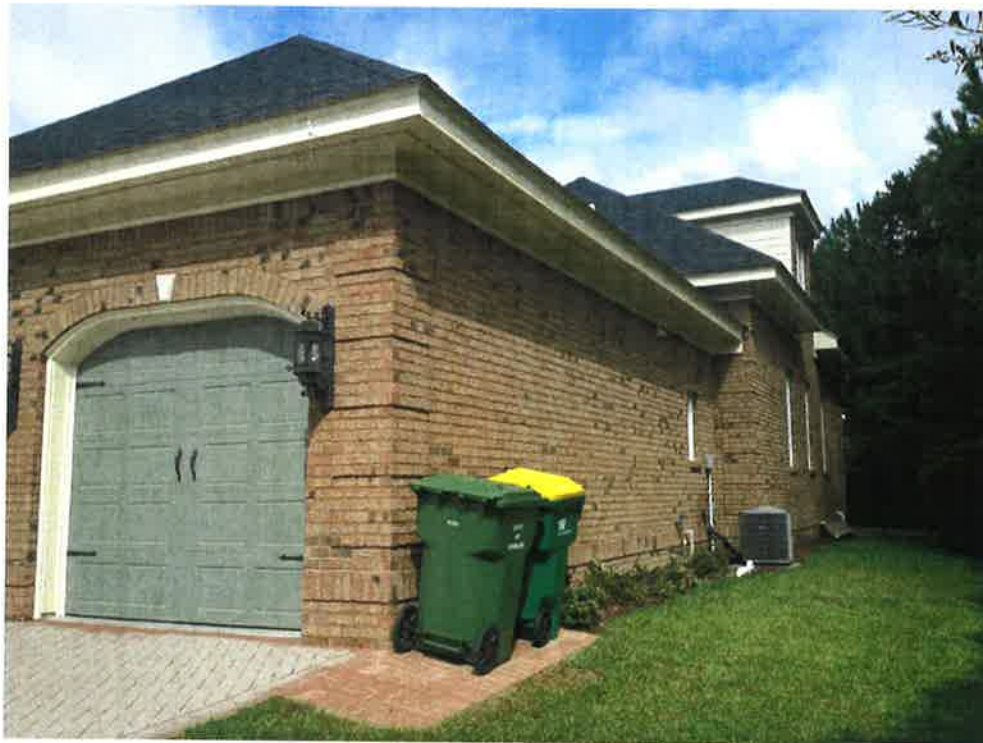
Rear View - 8-24-2012