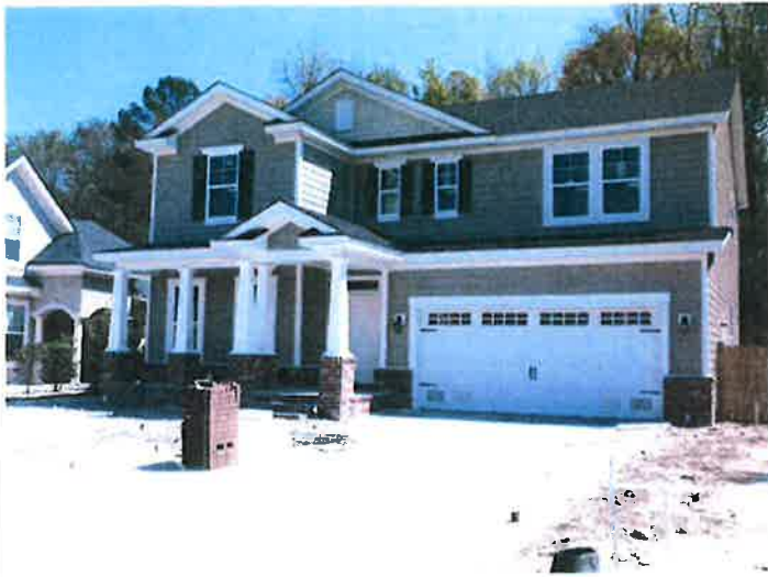
FRONT VIEW 3/29/2013