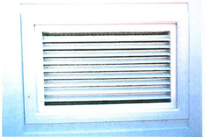
(TYPICAL) FLOOD SOLUTIONS LLC FLOOD VENT IN GARAGE DOOR 3/29/2013