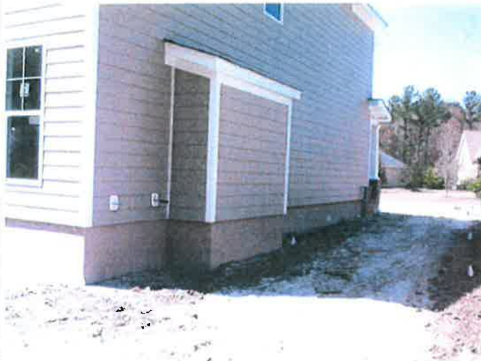
LEFT SIDE VIEW 3/29/2013