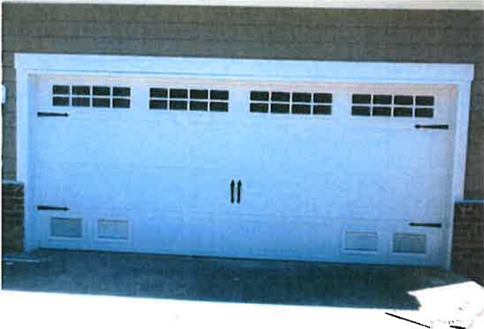
GARAGE DOOR 3/29/2013