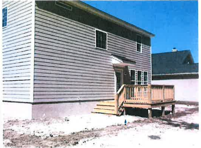
REAR VIEW 3/29/2013