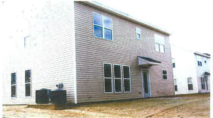
REAR VIEW 10/27/2010