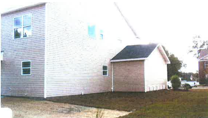
LEFT SIDE VIEW 10/27/2010