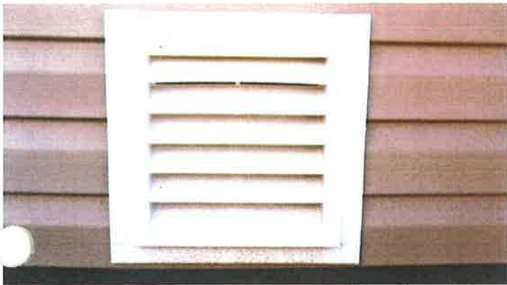
VENT IN ENCLOSURE (GARAGE) WALL (TYP) 10/27/2010