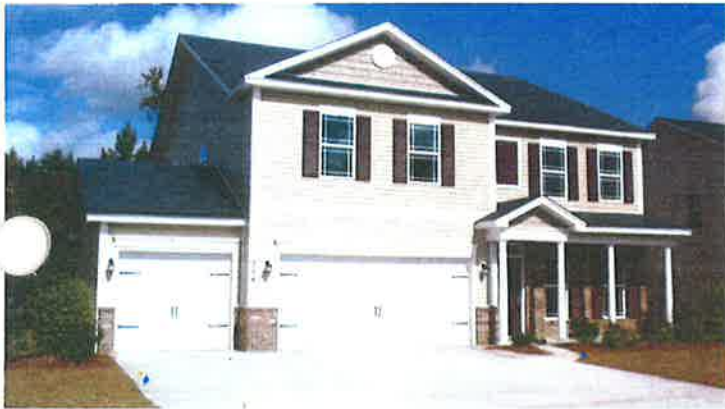
FRONT VIEW 10/27/2010