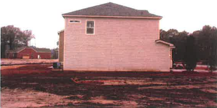
LEFT SIDE VIEW 1/25/2011