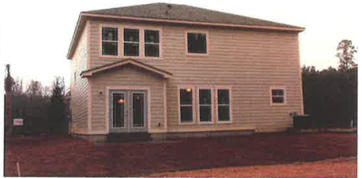
REAR VIEW/CONDENSING UNIT 1/25/2011