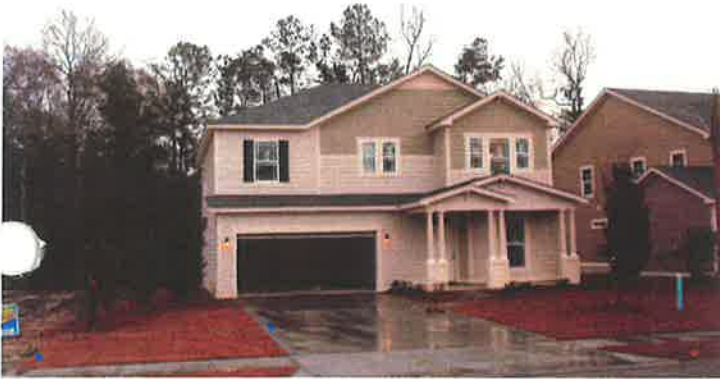
FRONT VIEW 1/25/2011