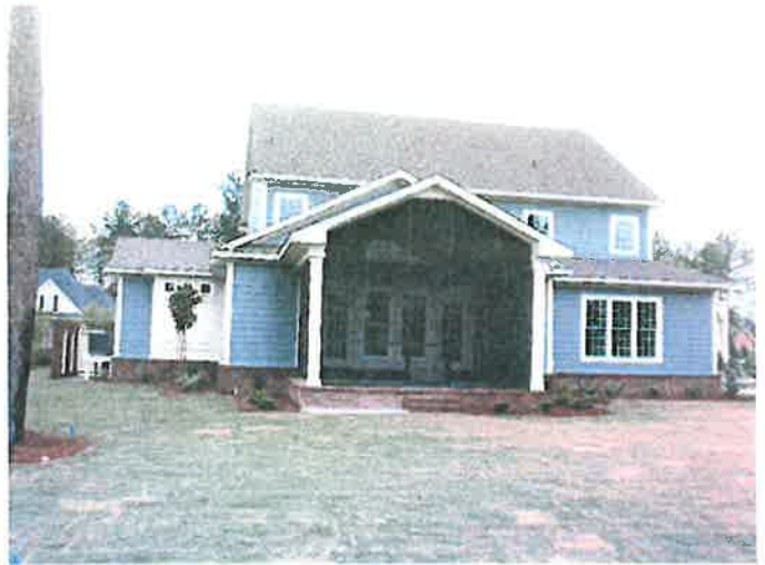
REAR VIEW 4/30/2013