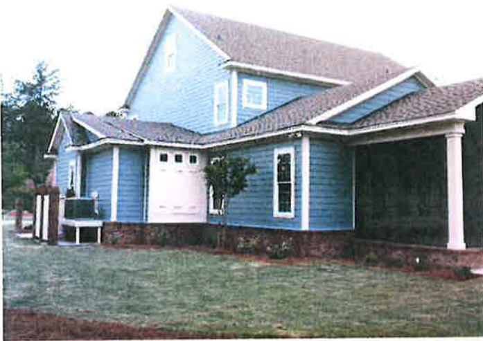
RIGHT SIDE VIEW 4/30/2013