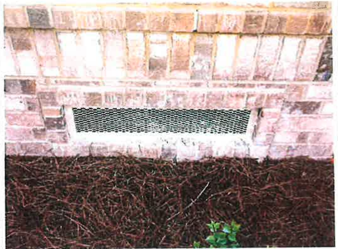
TYPICAL GARAGE WALL FLOOD OPENING 4/30/2013