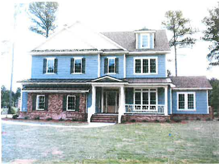
FRONT VIEW 4/30/2013