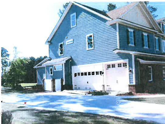
LEFT SIDE VIEW 4/30/2013