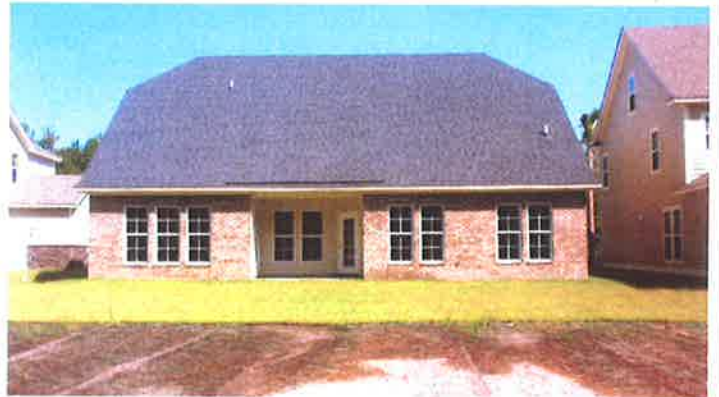
REAR VIEW 7/29/2011