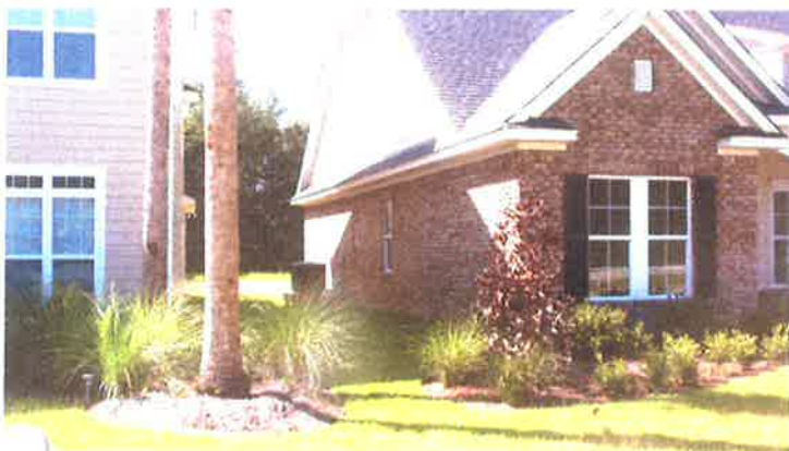
LEFT SIDE VIEW 7/29/2011