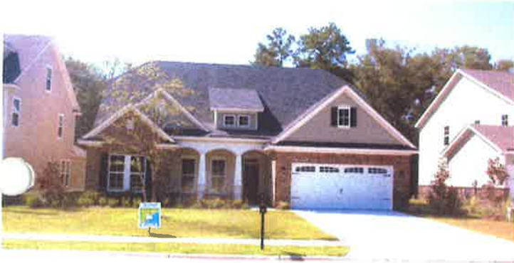
FRONT VIEW 7/29/2011