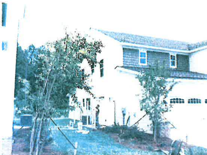
LEFT SIDE VIEW 7/26/2012