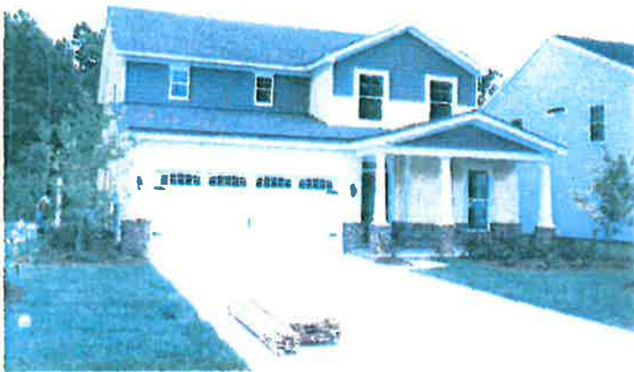
FRONT VIEW 7/26/2012