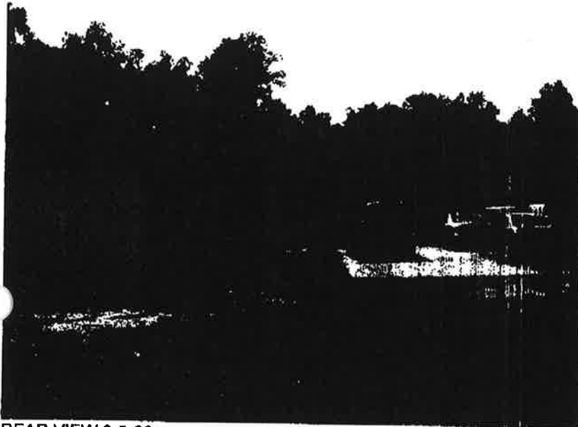
REAR VIEW 8-5-08