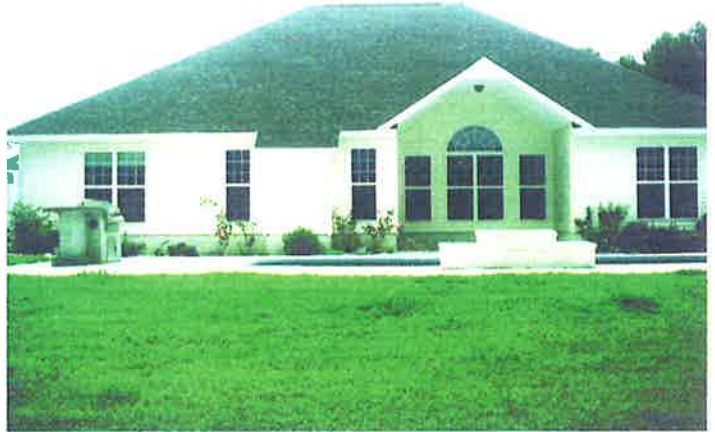
REAR VIEW 07/28/2010