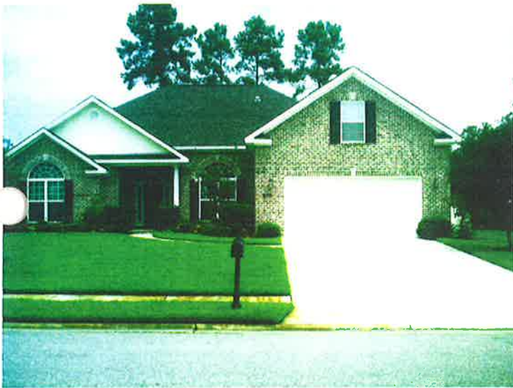
FRONT VIEW 07/28/2010