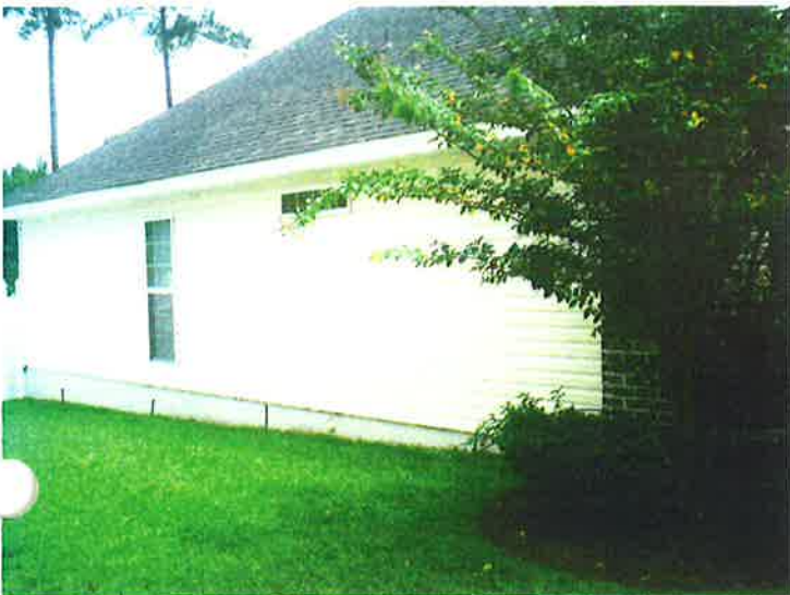
LEFT SIDE VIEW 07/28/2010