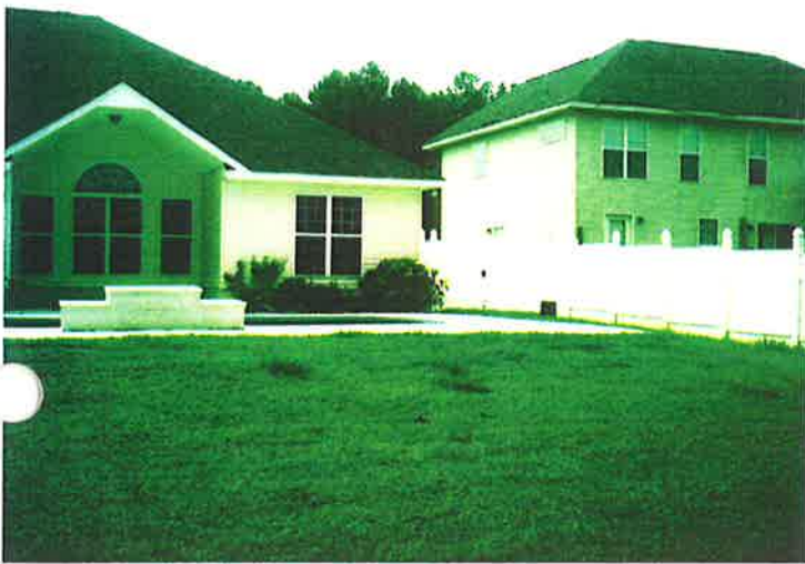
REAR VIEW 07/28/2010