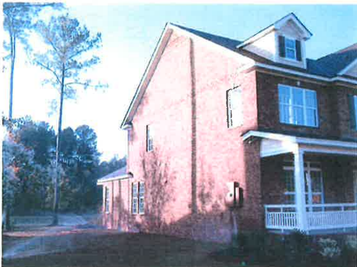
LEFT SIDE VIEW 11/08/2012