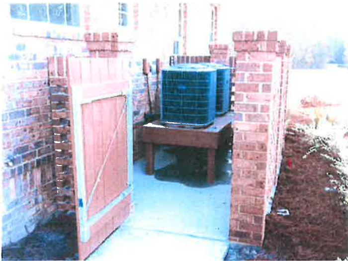
CONDENSING UNIT 11/08/2012