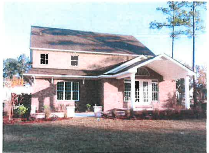
REAR VIEW 11/08/2012