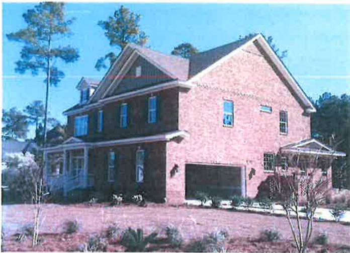
FRONT VIEW 11/08/2012