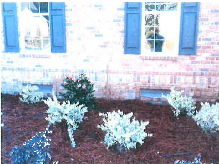
GARAGE FLOOD OPENINGS 11/08/2012