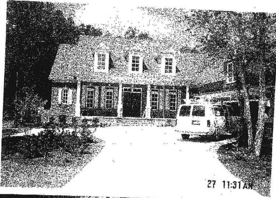
FRONT VIEW OF HOUSE. PICTURES TAKEN JUNE 27, 2008

If using the Elevation Certificate to obtain NFIP flood insurance, affix at least two building photographs below according to the instructions for Item A6. Identify all photographs with: date taken; "Front View" and "Rear View"; and, if required, "Right Side View" and "Left Side View." If submitting more photographs than will fit on this page, use the Continuation Page, following.