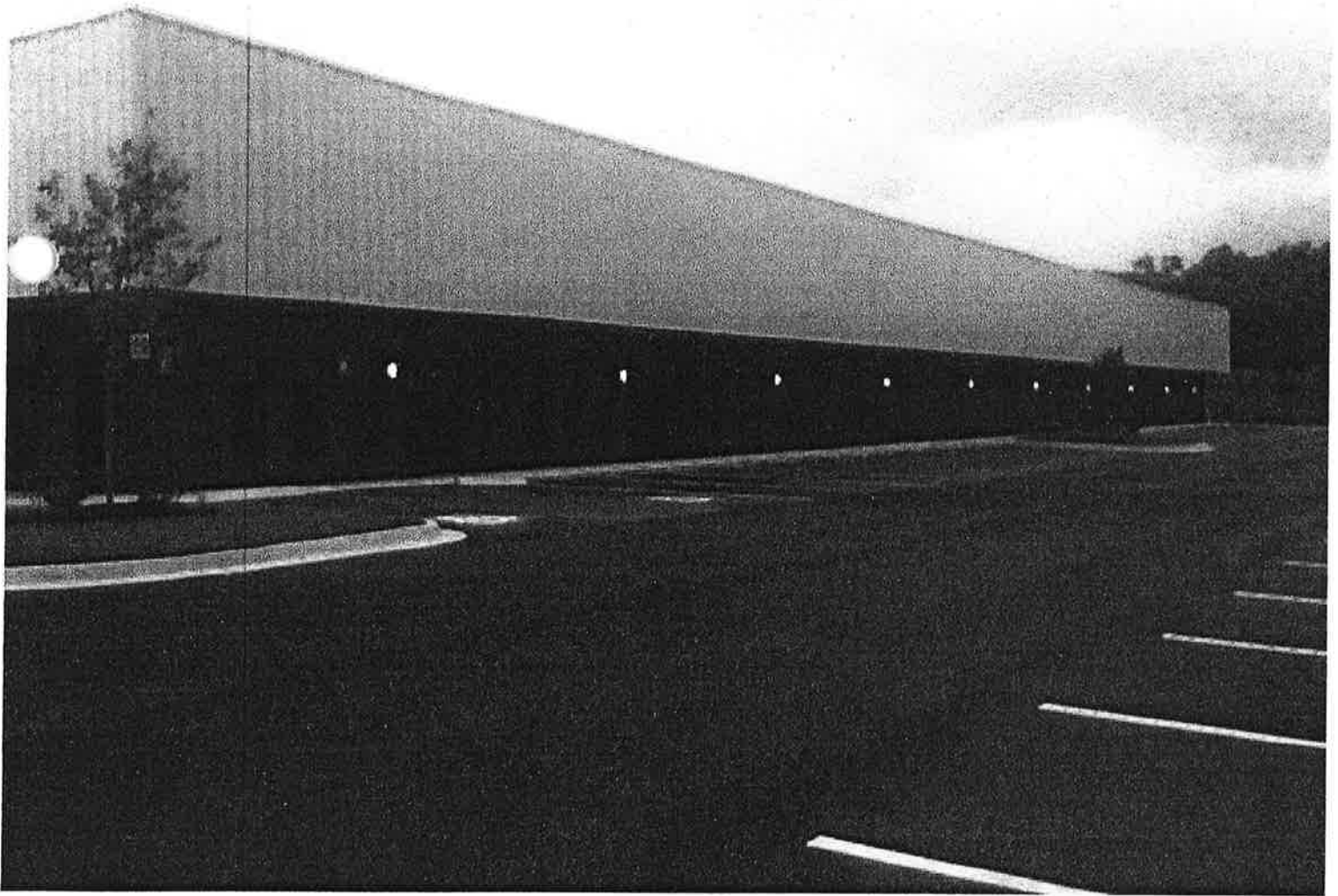
FRONT VIEW 6/20/07

If using the Elevation Certificate to obtain NFIP flood insurance, affix at least two building photographs below according to the instructions for Item A6. Identify all photographs with: date taken; "Front View" and "Rear View"; and, if required, "Right Side View" and "Left Side View." If submitting more photographs than will fit on this page, use the Continuation Page, following.