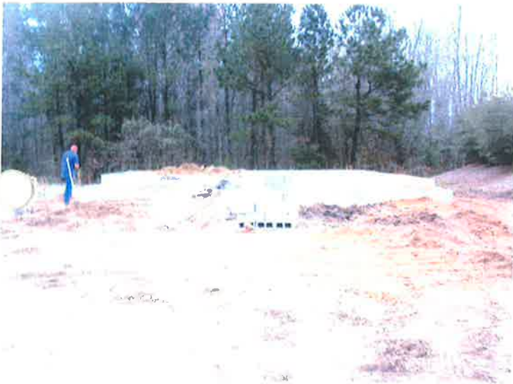
FRONT VIEW 3/01/2012