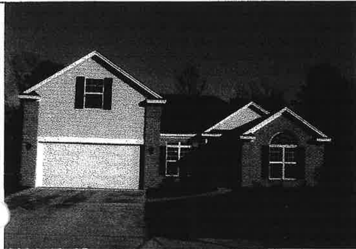
FRONT VIEW 01/02/08