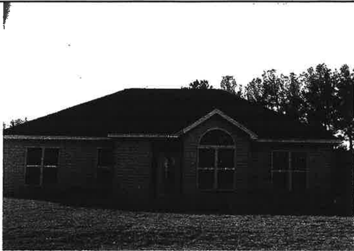
REAR VIEW 01/02/08