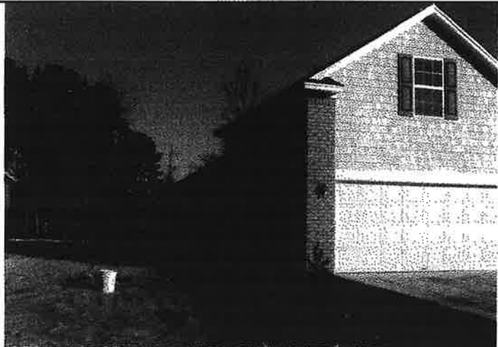
RIGHT SIDE VIEW 01/02/08