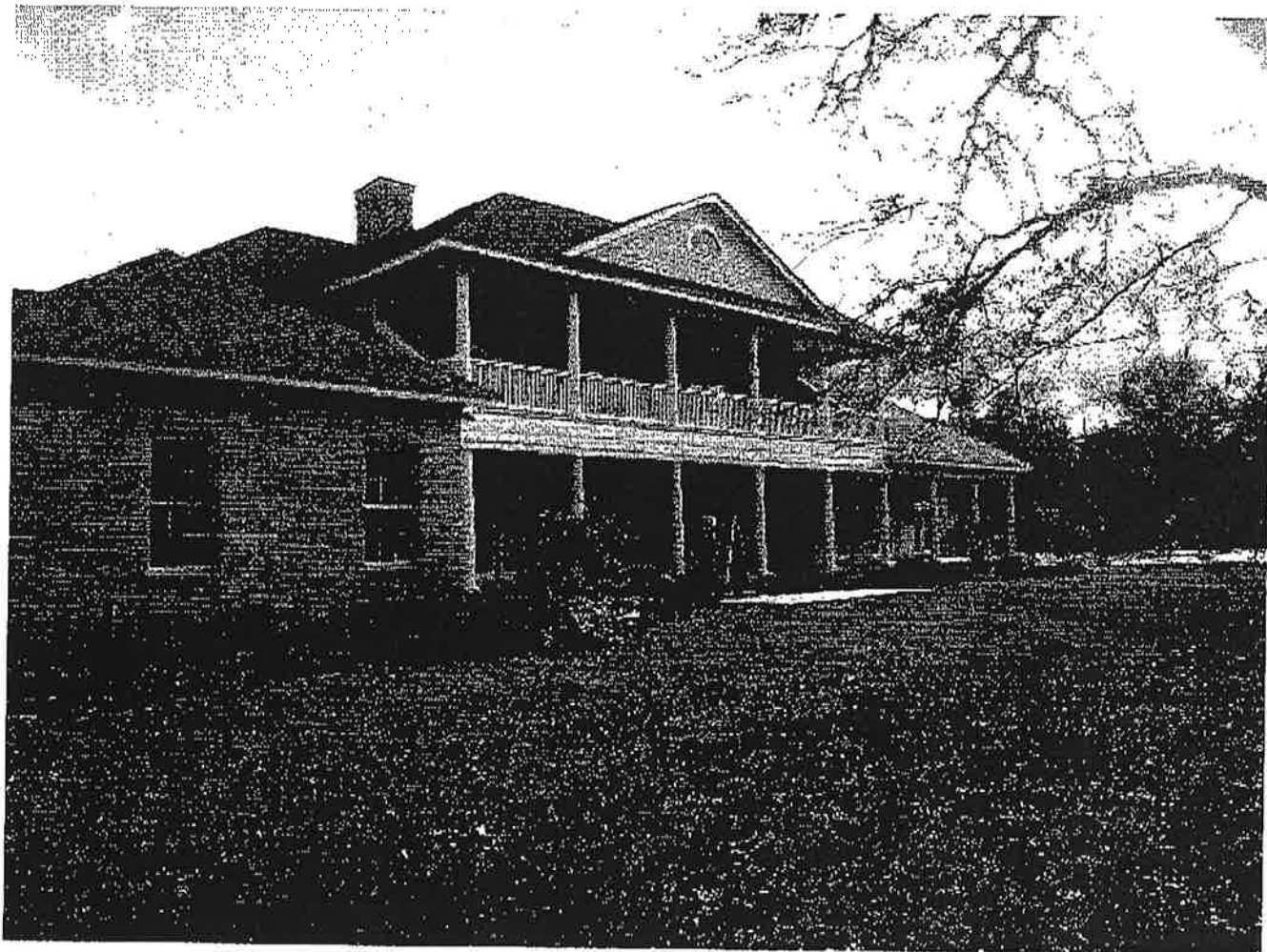
Rear View / 103 Sussex Retreat / 12-15-09

If submitting more photographs than will fit on the preceding page, affix the additional photographs below. Identify all photographs with: date taken; "Front View" and "Rear View"; and, if required, "Right Side View" and "Left Side View."