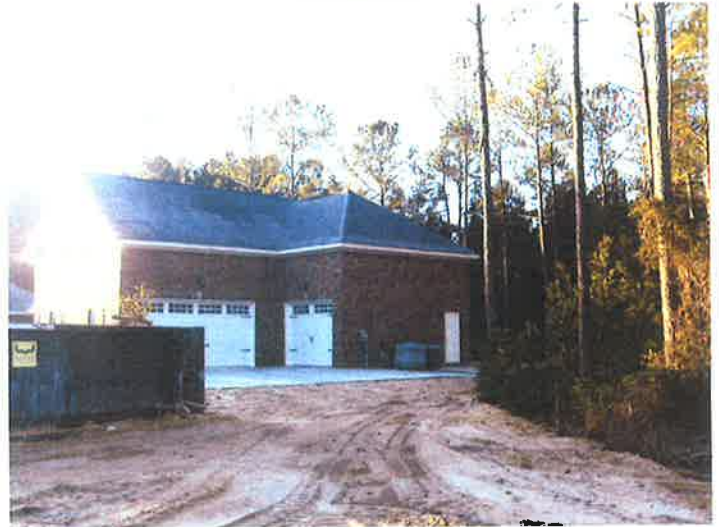
RIGHT SIDE VIEW 12/29/2009