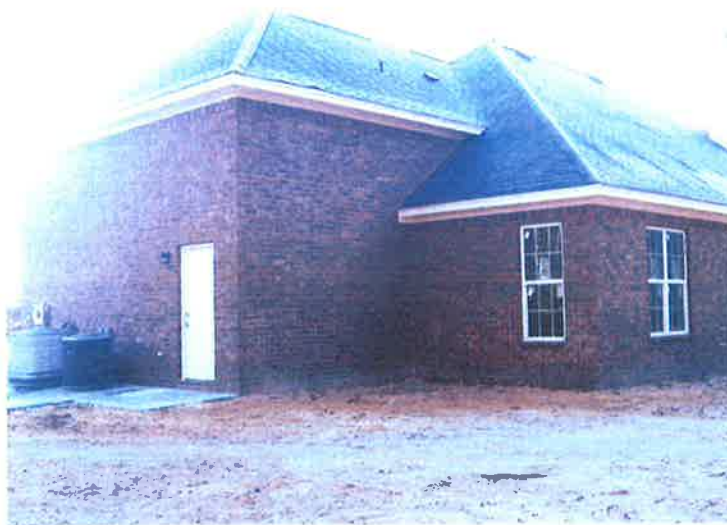
LEFT SIDE VIEW 12/29/2009