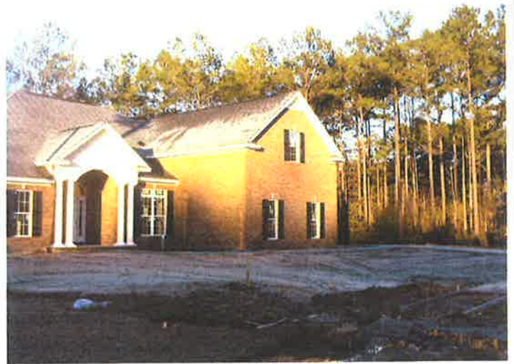
FRONT VIEW 12/29/2009