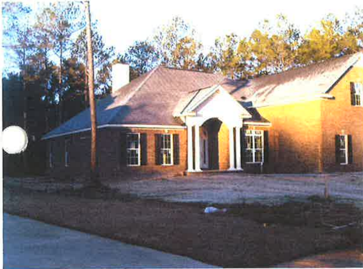
FRONT & LEFT SIDE VIEW 12/29/2009