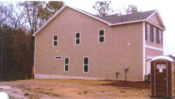
LEFT SIDE VIEW 02/10/2011