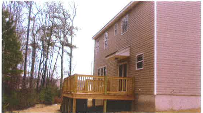
REAR VIEW 02/10/2011