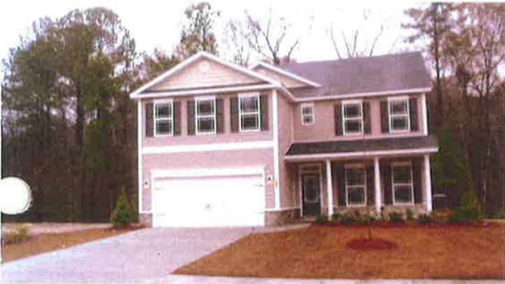
FRONT VIEW 02/10/2011