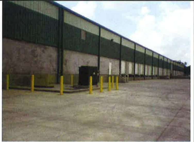
FRONT VIEW 06/23/08