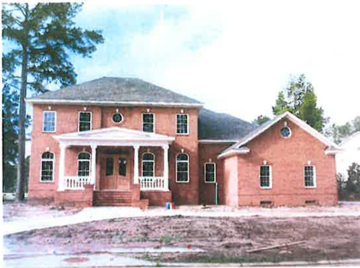
FRONT VIEW 7/15/2013