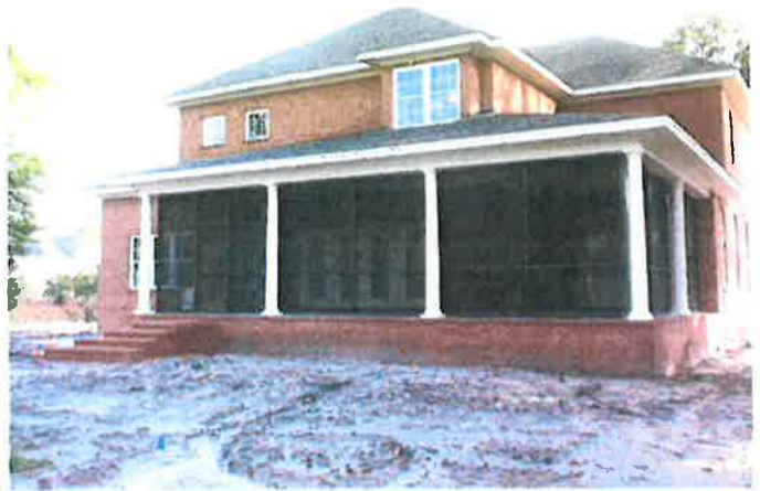
REAR VIEW 7/15/2013