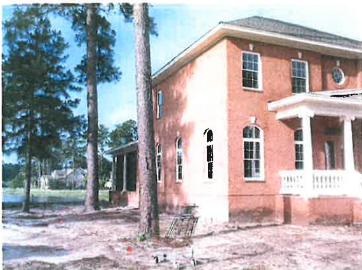
LEFT SIDE VIEW 7/15/2013