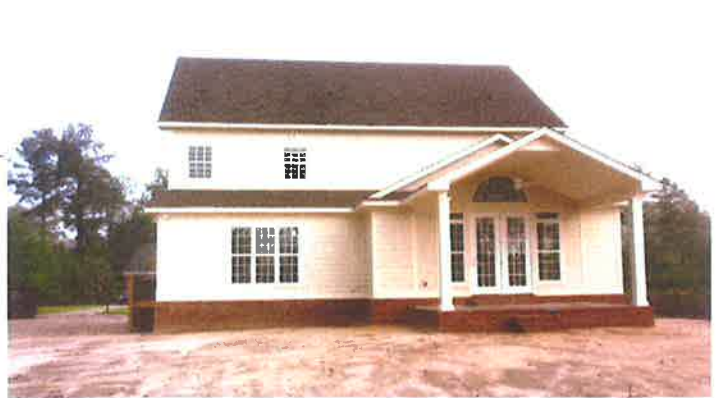
REAR VIEW 06/30/2011