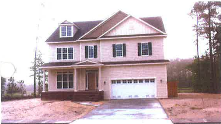
FRONT VIEW 06/30/2011