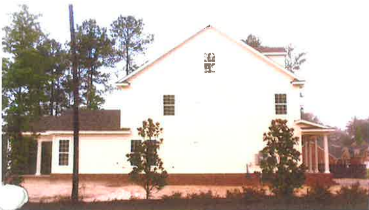
LEFT SIDE VIEW 06/30/2011