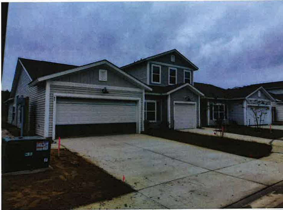
FRONT LEFT VIEW 10/11/2023

If using the Elevation Certificate to obtain NFIP flood insurance, affix at least 2 building photographs below according to the instructions for Item A6. Identify all photographs with date taken; "Front View" and "Rear View"; and, if required, "Right Side View" and "Left Side View." When applicable, photographs must show the foundation with representative examples of the flood openings or vents, as indicated in Section A8. If submitting more photographs than will fit on this page, use the Continuation Page.