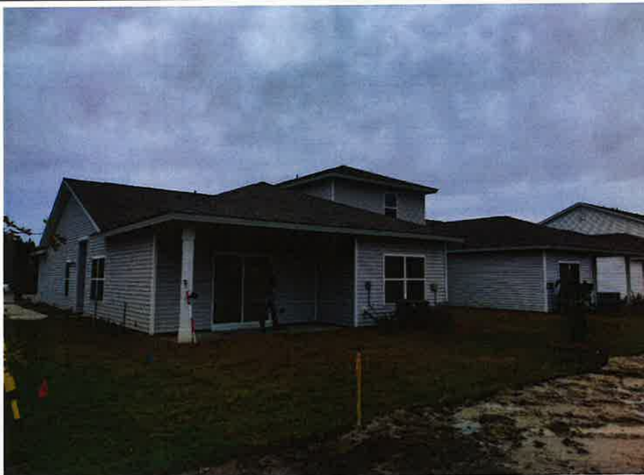
REAR RIGHT VIEW 10/13/2023